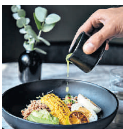
✓ Pool customer: Oku on Kos has owners and look The Moon and

Stars in Athens ▲ Cubism? The Kalesma on Mykonos Lunch at the Modernist in Athens